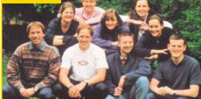
The Junior Doctors' Committee

CMF see it as a vital part of their ministry to support doctors during their years as a junior. The Junior Doctors' Committee is a group of juniors covering a range of hospital specialities and general practice. We meet three or four times a year to plan day and weekend conferences, and to try and think more broadly about the specific needs of juniors and how they can best be addressed within CMF.