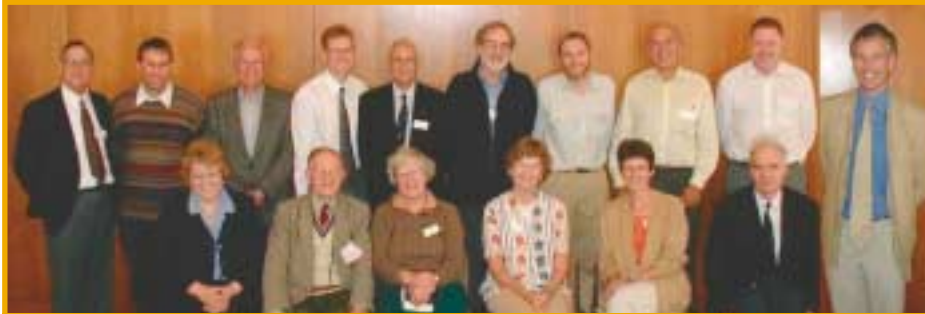
Attendees at the CMF Overseas Service Committee 'Away Day'