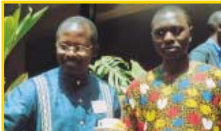
Some of the 100-150 delegates

ICMDA's first East Africa Regional Conference was held in Nairobi, Kenya, 8-12 August. Under the title 'Called to Serve' 100-150 delegates (including 40 students) from 7 African countries met for fellowship, ministry and challenges. The conference was hosted and ably organized by Kenya Christian Medical Fellowship.