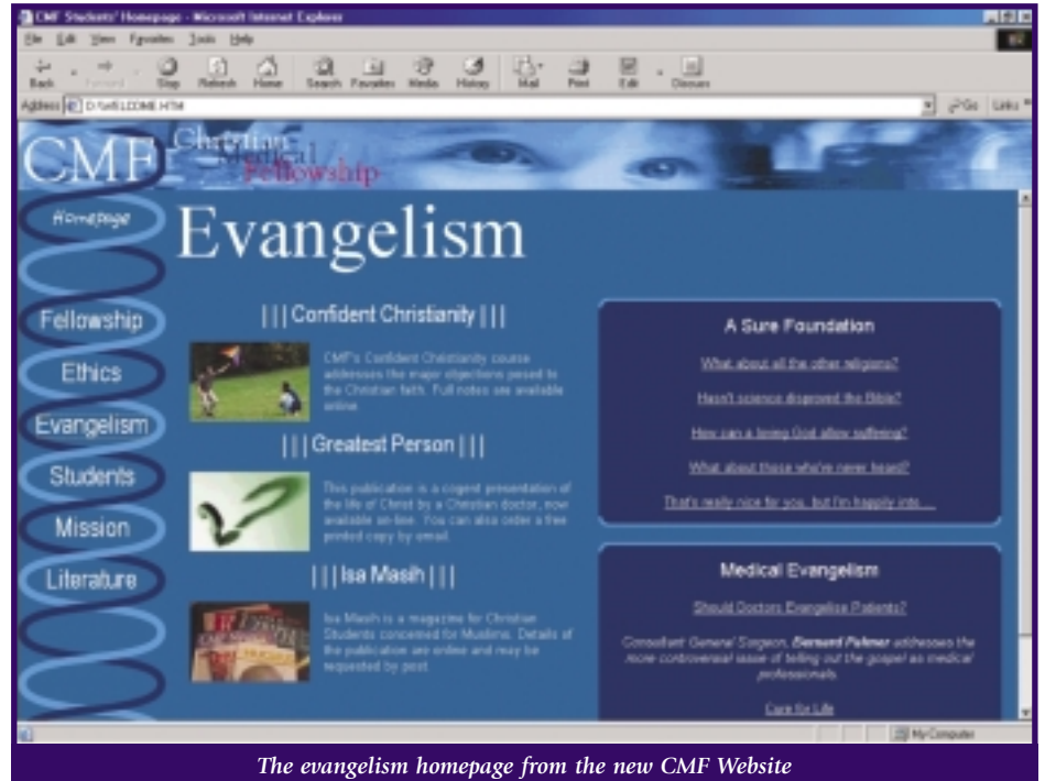
The evangelism homepage from the new CMF Website

A new CD-ROM will be released shortly afterwards. Watch this space.