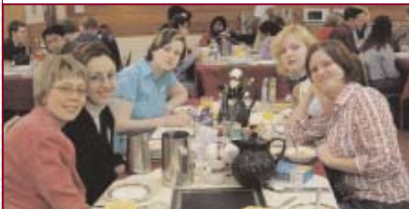
Delegates from Russia, Hungary, Lithuania and Latvia