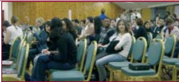
Students before a main session

The annual flurry of CMF summer team activity is fast approaching. This year we plan again to send student/doctor teams to several countries (such as Armenia, Latvia, Russia and Ukraine) during July and August in order to build links with local medics there. Teams involve a mixture of biblical, ethical, discipleship and medical teaching. Is there a group going from your local area? Are you