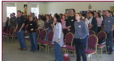
The main conference room

or decisions that we're all facing, rather than about the claims of Christianity? In our post-modern society we need to find a way to introduce Jesus into these conversations about relationships, buying a house, career plans etc, and show that Christianity is relevant to all areas of our lives. We're in the process of developing material that we will introduce at a juniors day conference in Birmingham on Saturday 12 March to help us do better in sharing our faith in this way, including case scenarios and role plays. If you're interested in joining us then watch this space.