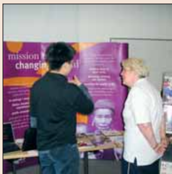
HealthServe Day displays

( www.makepovertyhistory.org ) but once you go overseas your view of life and work will never be the same again.