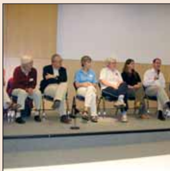
HealthServe Day speakers

There are endless opportunities to get involved in meeting the needs of the poor without even leaving these shores, in prayer and advocacy – including the current campaign to make poverty history