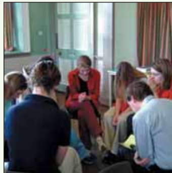
Student leaders' conference

International and overseas activities remain high on the agenda. The ICMDA European conference in Germany on 5-12