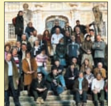
ARCHAЕ hosts international delegates