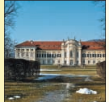
Schloss Schielleiten, site of 2008 Eurasia Conference