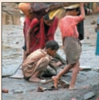
Children in the slums of Delhi

One member writes of wearing out six pairs of expensive trekking sandals in the past year as she has walked around her 'patch' - villages virtually inaccessible to even 4x4 vehicles. She describes (with delight) taking a high ranking Western Aid official, who wanted 'to see things as they really are', on a 3 hour walk