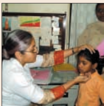
Asha Clinic, India

to a village to see a work part-funded by his organisation. They had to wade through five rivers in flood, thigh high and crocodile infested, to get there. She had forgotten to tell him that they would be in flood! It was 'fun' she said and the aid still continues to flow!