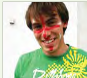
A loyal England fan!