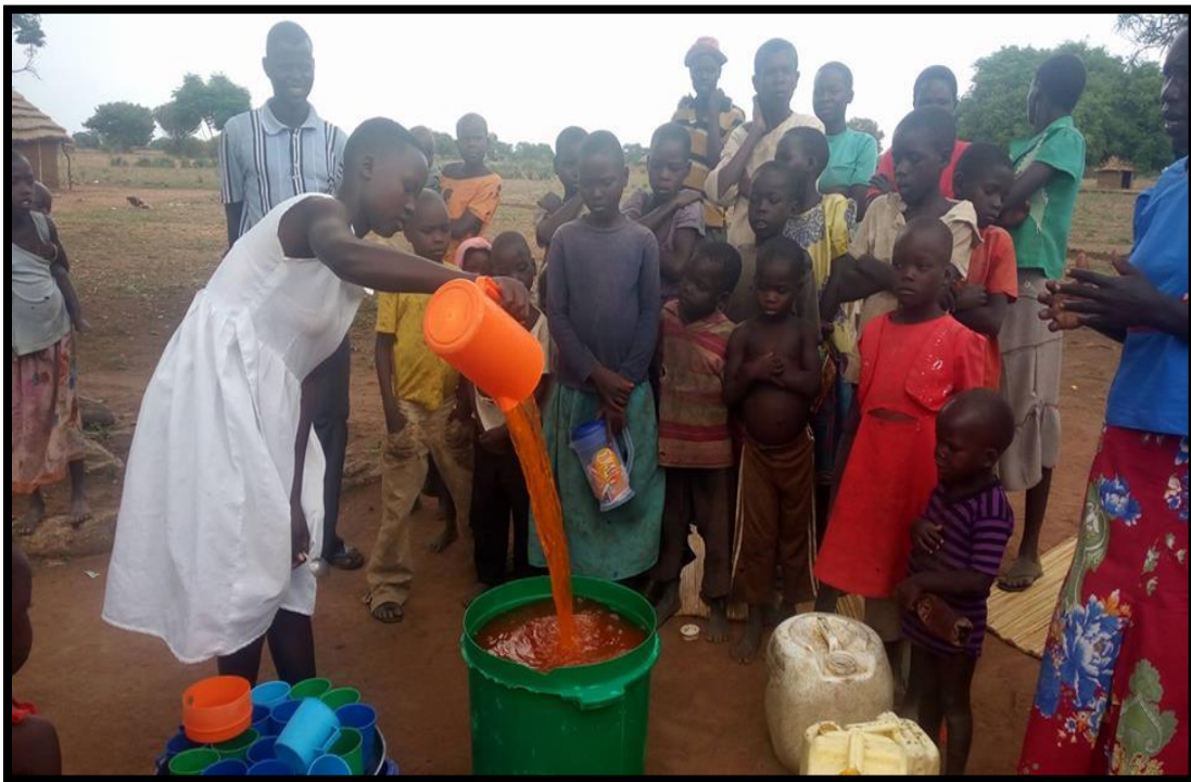
Bread for the Hungry works with forgotten Children as well.