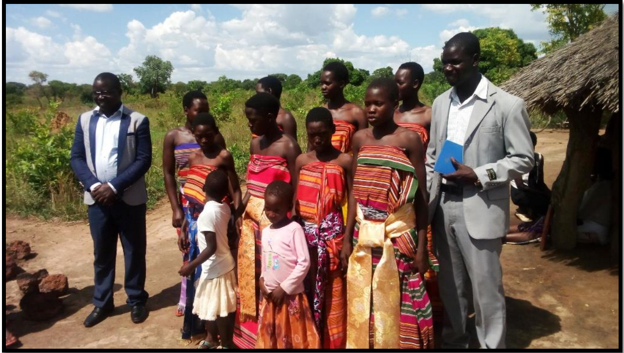
Urafiki Africa Children's Choir with First Grace Brethren Staff during a Tour to Amuria Churches (2017).