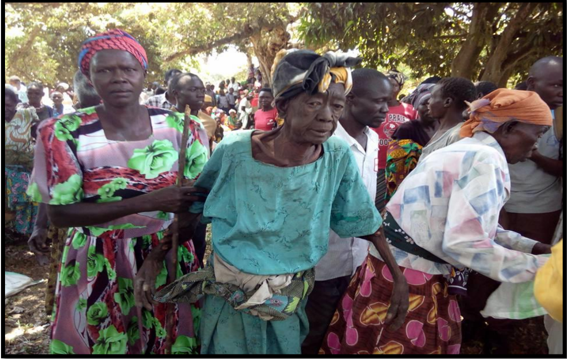
Bread for the Hungry works with deprived Communities as shown above.