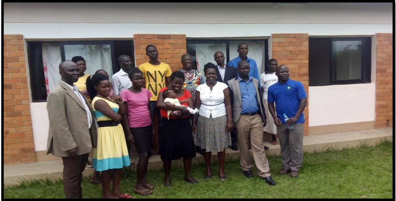
Equipping Pastors and Church Leaders for effective Ministry at FGBC, Soroti.