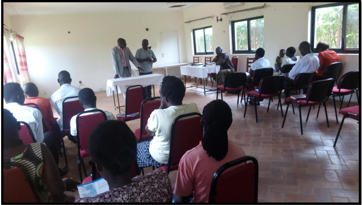
First Grace Brethren Chapel, Soroti on Sunday service.