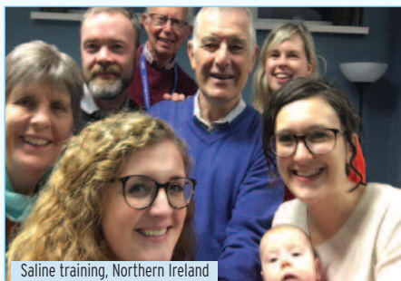
Saline training, Northern Ireland